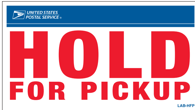
Exhibit 4.1.4e Official Hold For Pickup Endorsement, Label LAB-HFP