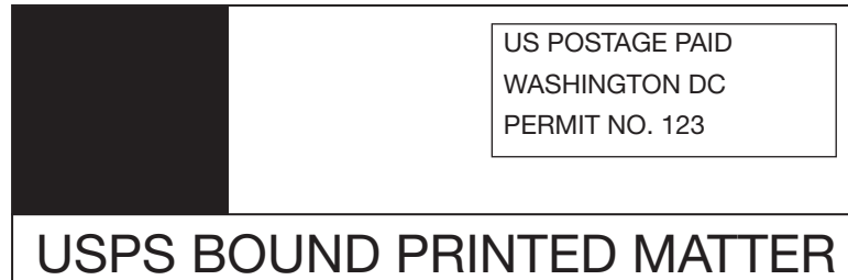
Exhibit 3.3.1 Package Services Indicator Examples

printed in minimum 20-point bold sans serif typeface, uppercase letters, centered within the banner, and bordered above and below by minimum 1-point separator lines. There must be a 1/16-inch clearance above and below the text.