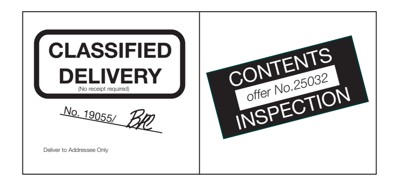
Exhibit 1.5 Prohibited Imitations

Matter bearing decorative markings and designs, in adhesive or printed form, resembling the markings and designs of official postal services, is not accepted for mailing (see Exhibit 1.5).