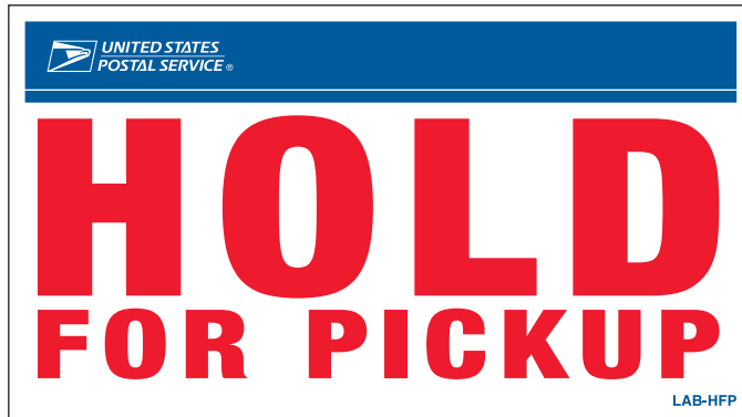
Exhibit 4.1.4e Official Hold For Pickup Endorsement, Label LAB-HFP